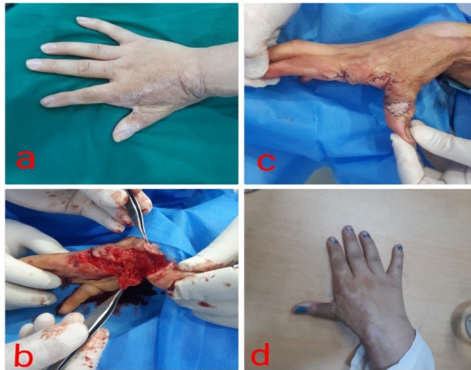
Figure 2. Shows preoperative patient's hand (a), intraoperative flap elevation (b), directly postoperative using one small piece of skin graft (c), and postoperative after six months (d).